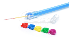
Divisible Duct Sealing