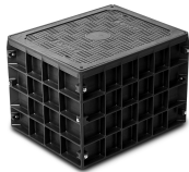
Telecom Manhole Chamber