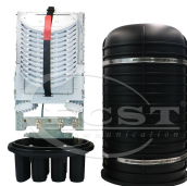
Fiber Optic Splice Closure