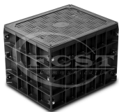
Telecom Manhole Chamber